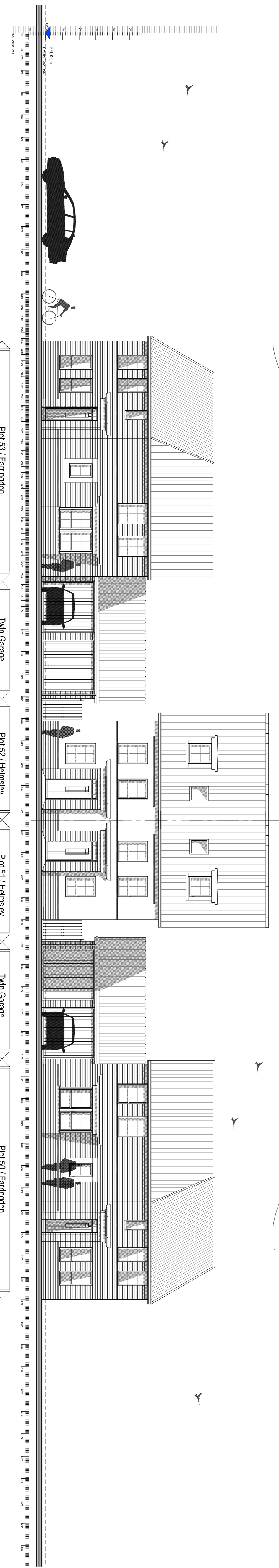
Street Scene C C